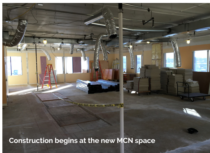
Construction begins at the new MCN space